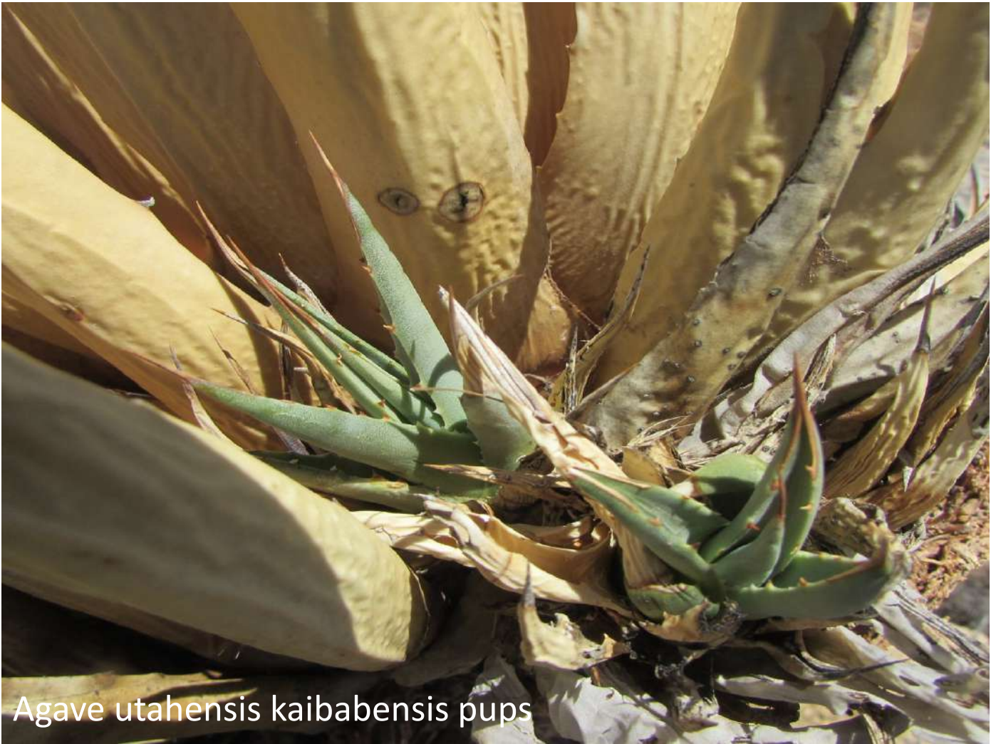
Agave utahensis kaibabensis pups