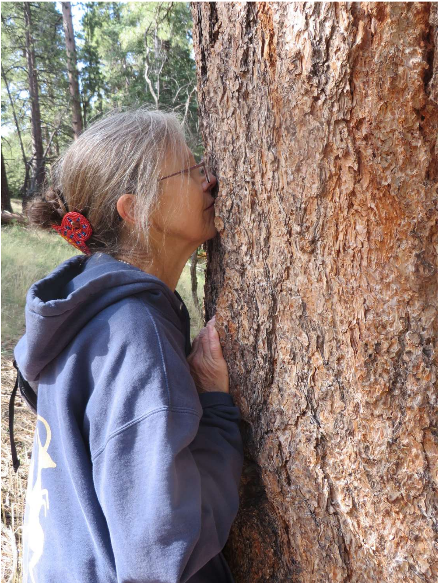
Getting my vanilla fix along the North Rim, Grand Canyon