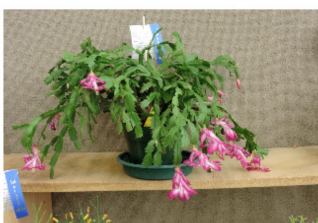
an epiphytic cactus