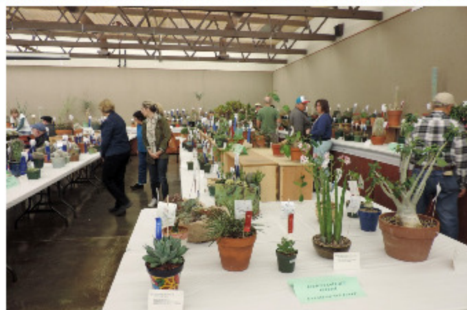
Overview of Show

In addition , again this year's show had an excellent addition, provided by Sig Lodwig: several flats of seedlings at various stages of growth, with details of their histories. and also a computerized display of many sorts of flowering cacti. Many visitors were very interested!