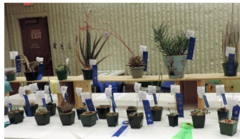
the Best Succulents