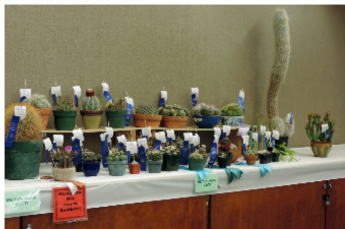
the Best Cacti