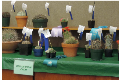
Some of the Best Cacti