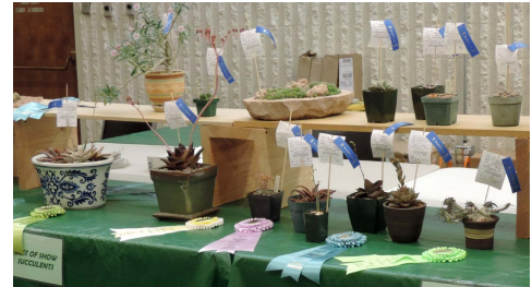
Some of the Best Succulents