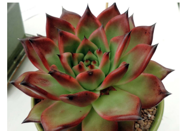
Echeveria agavoides "Ebony Super Clones"