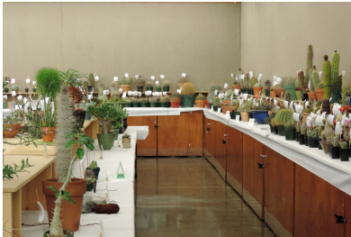
Overview of Show

In addition, again this year's show had an excellent addition, provided by Sig Lodwig: several flats of seedlings at various stages of growth, with details of their histories. and also a computerized display of many sorts of flowering cacti. Many visitors were very interested!