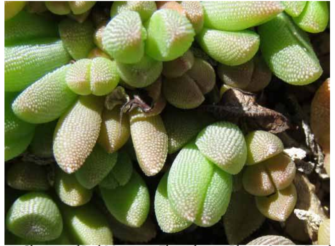
Close up of Red Mountain Flame leaves

To grow them in central NM a few points merit discussion. They like shallow gritty soil, loam with plenty of grit, stones, and low in organic matter. Their preferred light level is in the range of half to three quarters full sun. They are not hard desert species; they have adapted to grow in rock cracks where summer rains come. Water them about once every two weeks (unless it rains) when temperatures are above freezing. You can also grow them in troughs or shallow pots (3-5 inches deep). Once established they will be very tough. They need very little care and provide a lot of color to the xeric garden. ☼