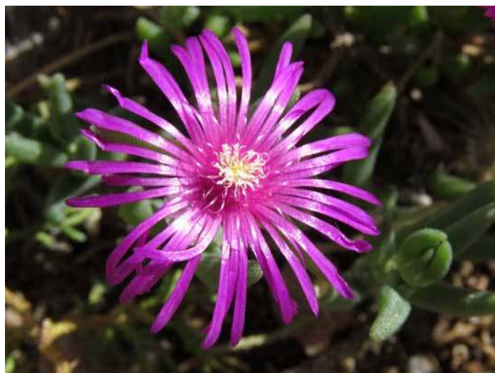
D. cooperi

Apart from D. cooperi , most of the plants available in the trade have cultivar names. The taxonomy of the origin of these cultivars is not clear. Many of them are from selections or hybrids of D. dyeri .