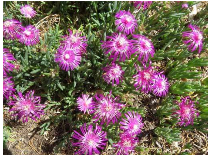
D. cooperi

The most commonly found species is Delosperma cooperi , which is quite a tough plant. I have seen them in close to full sun in local gardens and they will flower over a very long season. If the spring and early summer months are very dry, they will flower much better with water given every one or two weeks. If they are planted in deep shade they