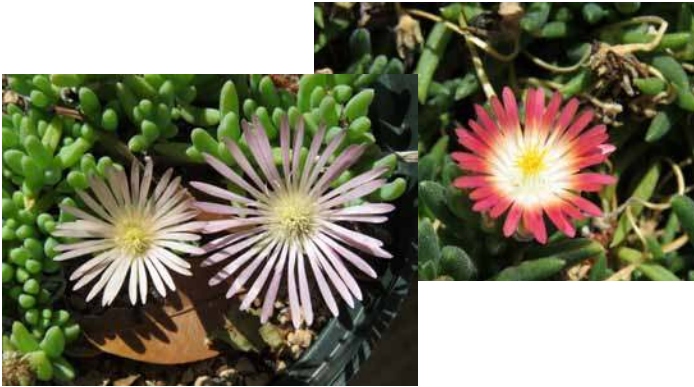
Above left: D. 'Alans Apricot' ; Above right: D. JOD Ruby.