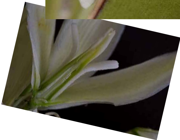
top: Yucca thompsoniana-KoningsYard2015-07-AdKonings middle: Tegeticula mexicana (Yucca torreyi moth)-BBNPoldOreRoad2016-02-GertrudKonings bottom: Yucca thompsoniana-KoningsYard2015-25-AdKonings