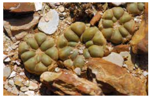
Cintia knitzii, these Bolivian plants are endangered due to large scale commercial collecting.