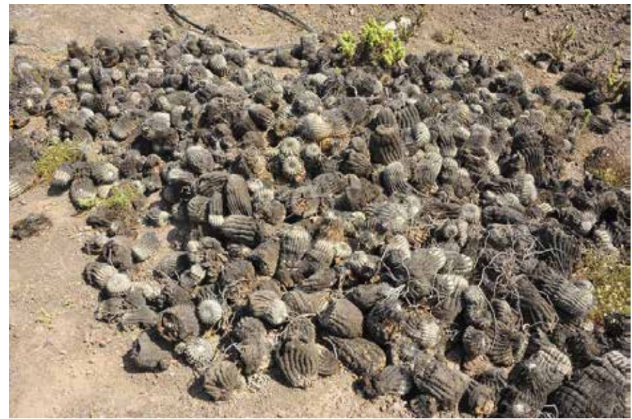
Piles of Copiapoa cinerea after being removed for urban development near Taltal, Chile. Published in: Why the black market for cacti and succulents is boom | MNN - Mother Nature Network.