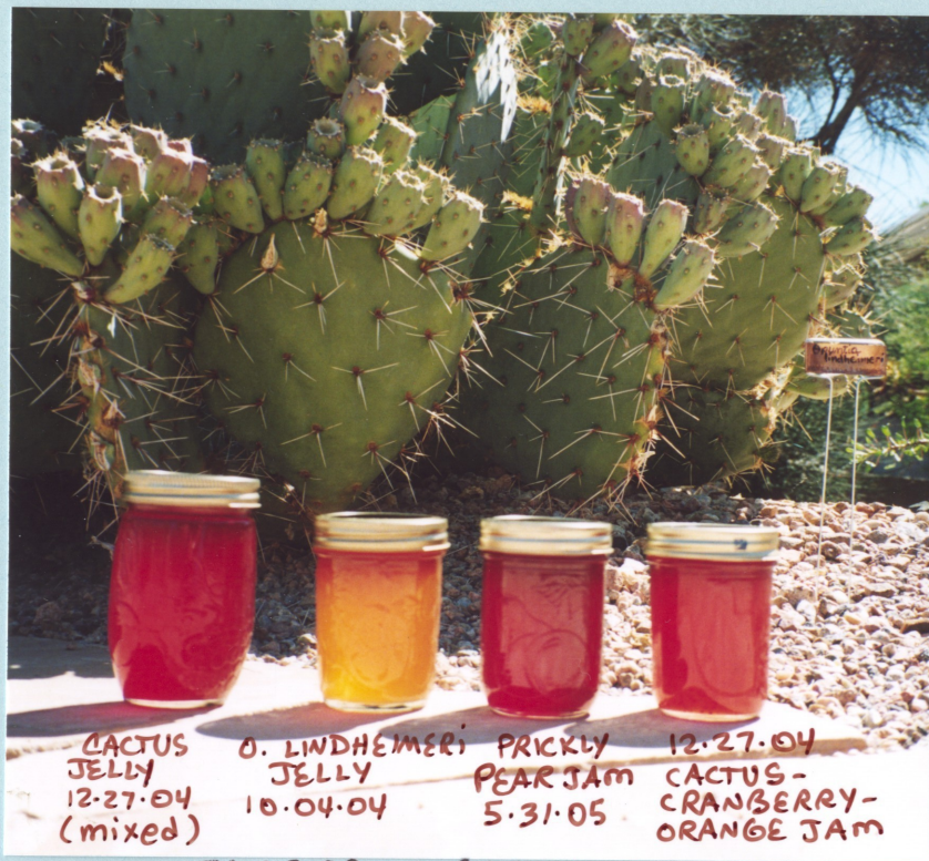
CACTUS JELLY 12-27-04 (mixed) O. LINDHEIMERI JELLY 10-04-04 PRICKLY PEAR JAM 5-31-05 12-27-04 CACTUS- CRANBERRY- ORANGE JAM