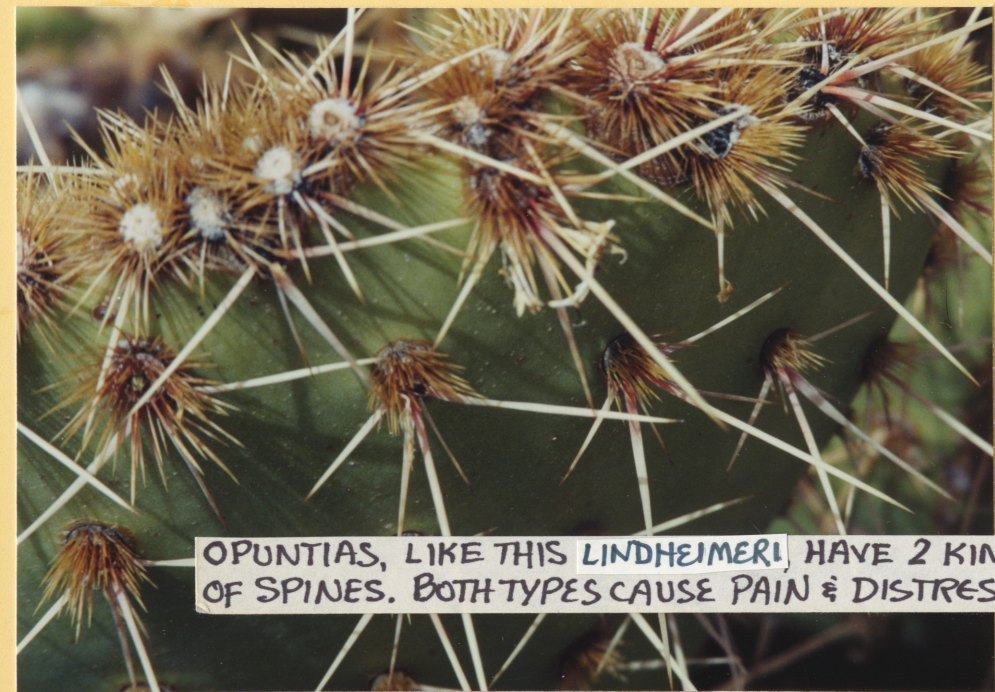
OPUNTIAS, LIKE THIS LINDHEIMERI, HAVE 2 KINDS OF SPINES. BOTH TYPES CAUSE PAIN & DISTRESS!