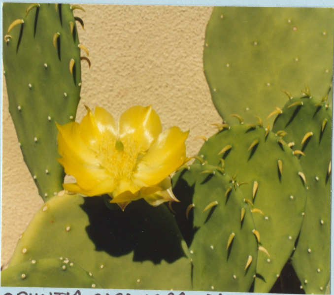
OPUNTIA CACANAPA v. ELISIANA is nearly spine-free. New pads the size of your hand (when they still have little fleshy leaves) are easy-to-clean NOPALES...

OPUNTIA PADS are really succulent STEMS. The leaves are small fleshy growths on new pads. They soon fall off.