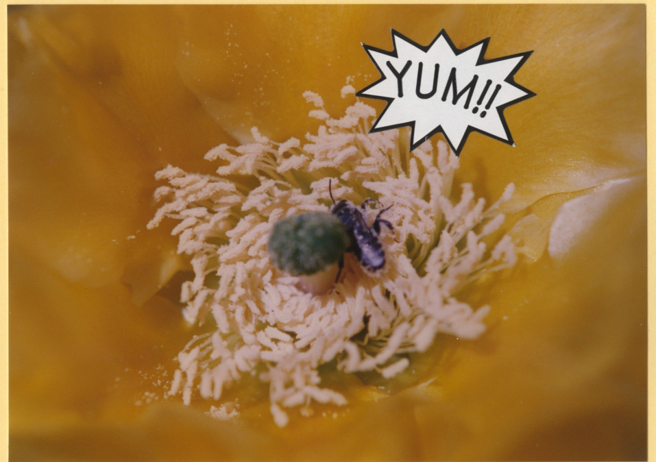
BEEES LOVE TO WALLOW 'in OPUNTIA POLLEN and help form the tasty fruits...