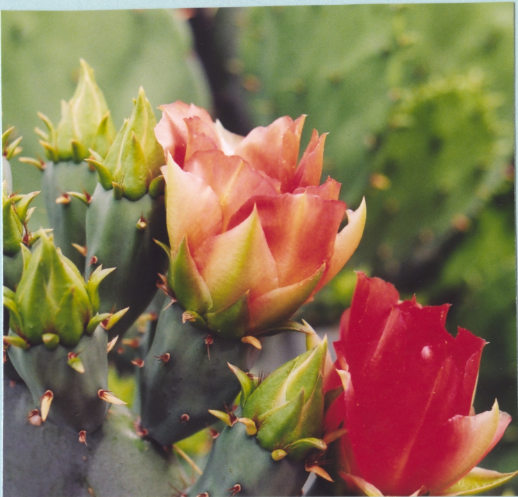
OPUNTIA LINDHEIMERI (orange-flowered cultivar) "Tangerine Prickly Pear."